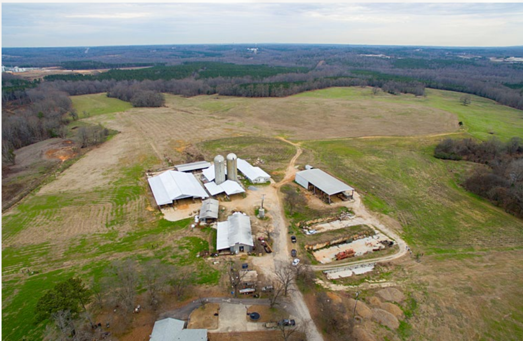
VIEW OF REAR OF PROPERTY.