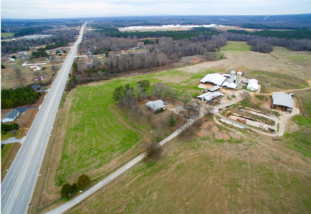
VIEW ALONG HIGHWAY 290 IN SPARTANBURG COUNTY, SC.

2004 MOORE DUNCAN HIGHWAY, SPARTANBURG COUNTY, SOUTH CAROLINA